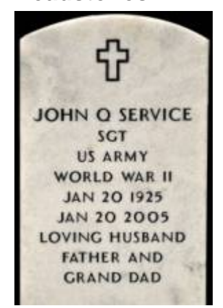
Upright Marble or Upright Granite