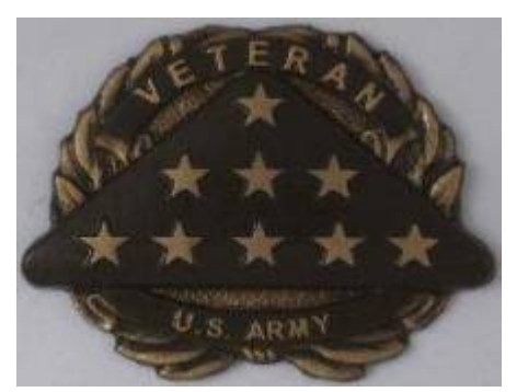
Medium or Large Medallion

The Department of Veterans Affairs provides a medallion, by request, to be affixed to an existing, privately purchased headstone or marker to signify the deceased's status as a Veteran.