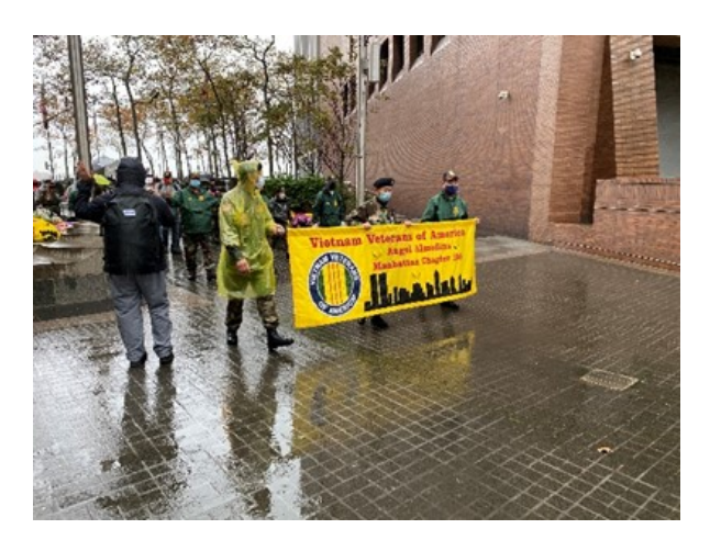
(Continue on pg. 26)